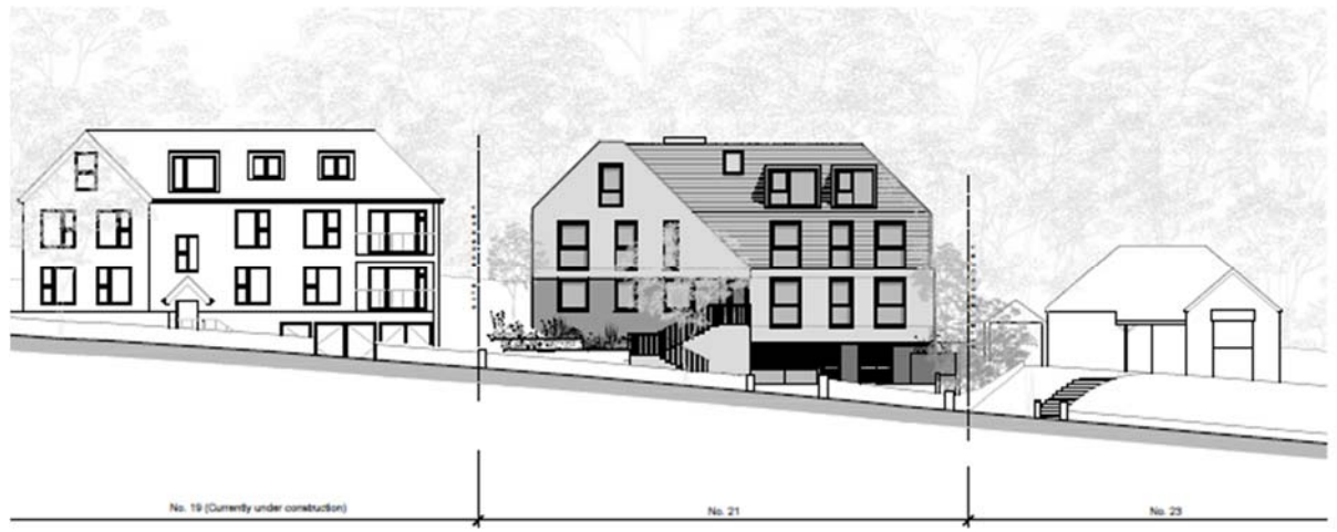
Figure 7 - Proposed Downsview Road street scene

8.19 The building to the north (number 19) which is currently under construction is a two storey building with accommodation in the roof and a lower ground floor (reference 20/01303/FUL), and is similar to what is being proposed as part of this application (see figure 7 below).