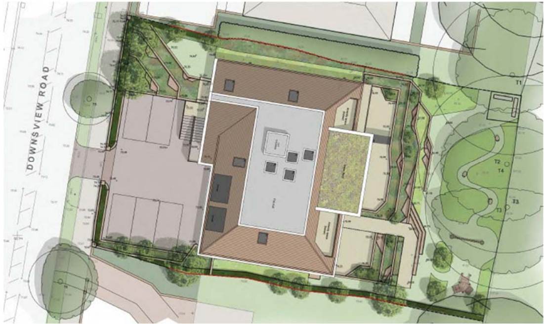
Figure 10 - Exert from Landscaping Strategy

the tiered landscape to the north west corner of the plot; the ground floor amenity spaces serving the ground units; the tiered landscape behind and the rear communal garden with play space to the rear of the plot.