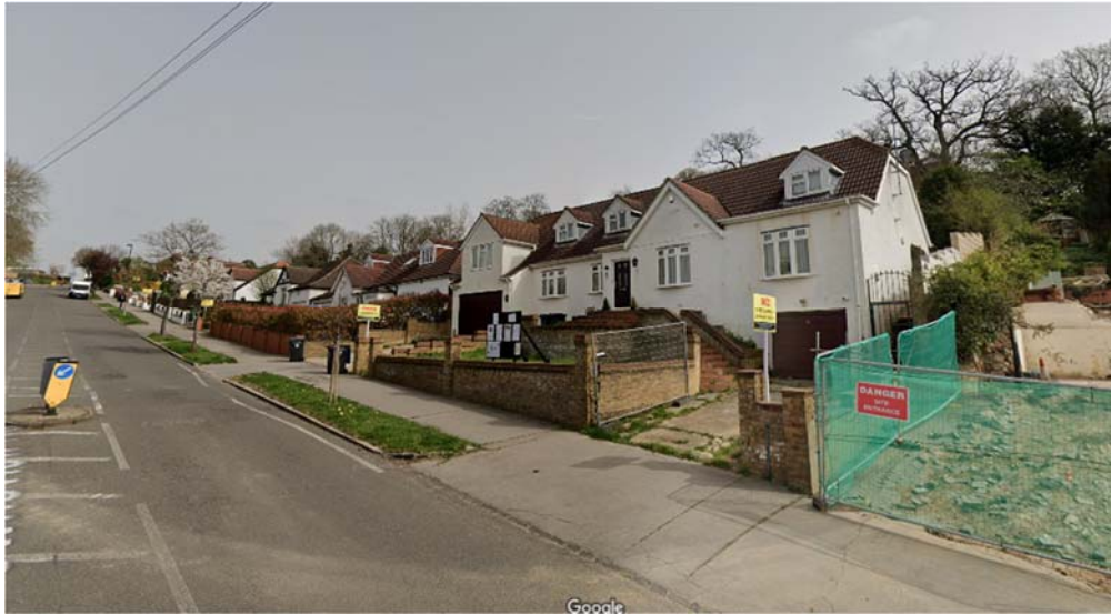
Figure 5 - 17 Downsview Road

8.19 The building to the north (number 19) which is currently under construction is a two storey building with accommodation in the roof and a lower ground floor (reference 20/01303/FUL), and is similar to what is being proposed as part of this application (see figure 7 below).