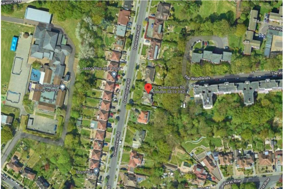
Figure 3 – Google maps view of site