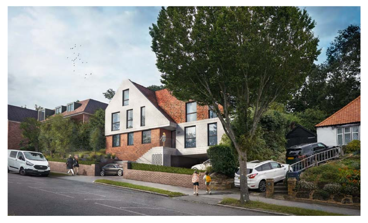
Figure 1 - CGI of front of proposal (eastern elevation)